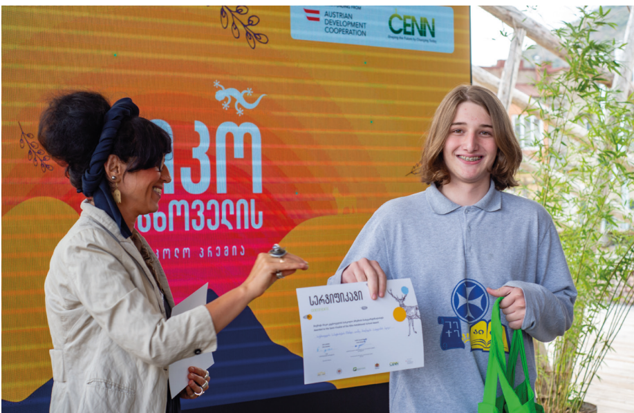
Semifinal of Niko Ketskhoveli School Award 2020

"Essentially, the forest code will introduce the multifunctional management of forests according to assigned categories (Protective, Protected, Recreational or Agricultural forest), introducing inclusive forms of forest management by involving communities, municipalities, private agricultural entities, and the Church, and by establishing commercial use of a forest's non-timber resources. The initiative was carried out within our sustainable forest management project funded by the Austrian Development Cooperation."