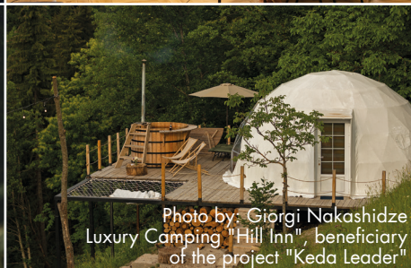
Luxury Camping "Hill Inn", beneficiary of the project "Keda Leader"

out activities to help slow the spread of COVID-19 in target regions and also to help vulnerable communities to protect themselves and adapt to the situation created by the pandemic.