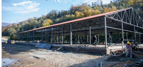
Agroksele LTD, Keda, Village Dzentsmani. Local dried fruit enterprise funded by the project "Keda Leader"